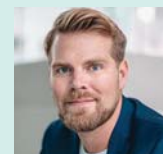
Benjamin Steinmetz Nio